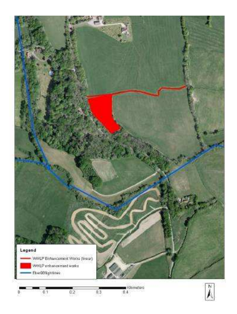
Legend WHIP Enhancement Wirely Sinery WAIP scharce ments wide. Adviced workland.