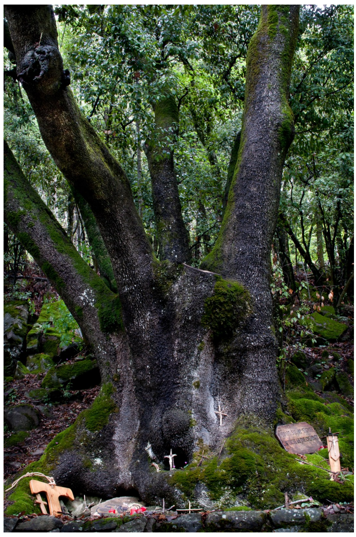
The giant holm-oak Leccio delle Ripe in Piancastagnaio, Tuscany, is associated with St Francis of Assisi and remains a popular destination of vows and pilgrimages